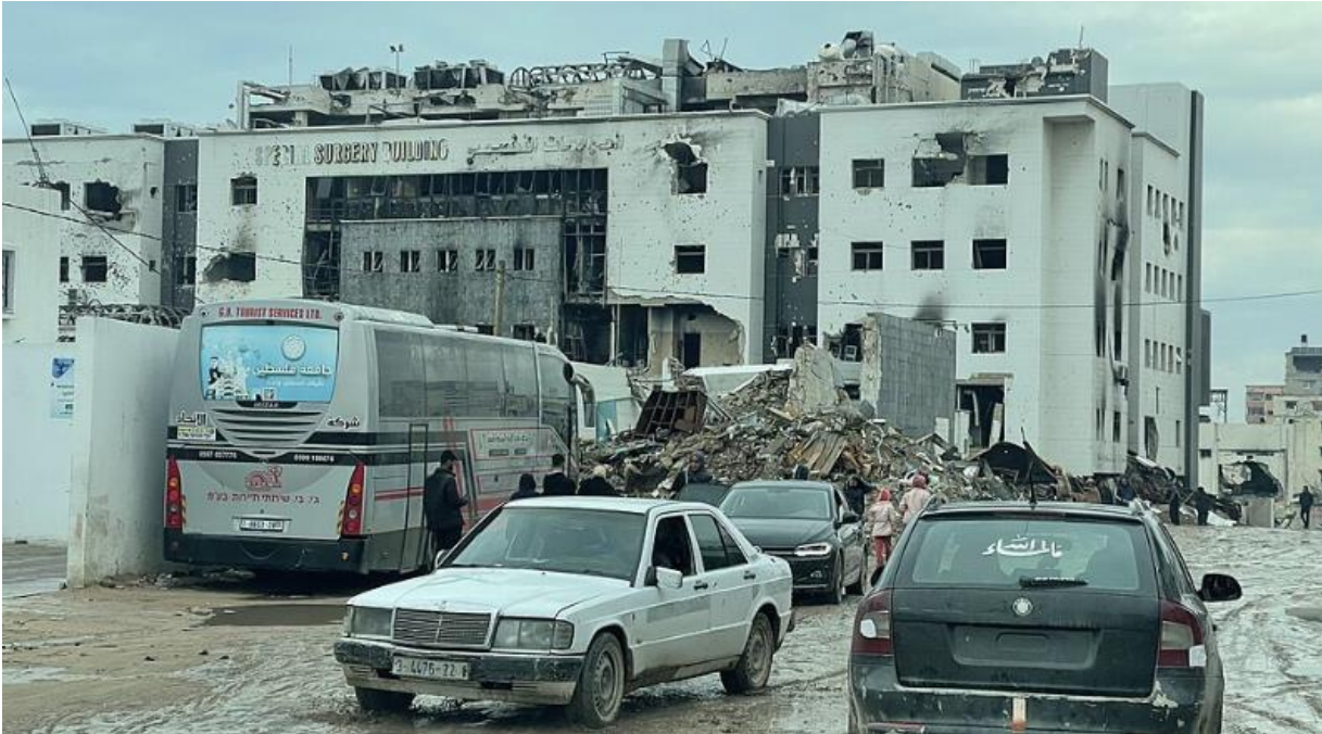
Shifa Hospital following the battle between Hamas terrorists and the IDF